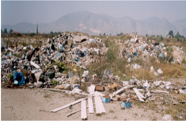
Figure 4: Uncontrolled landfill next to Titarisios River.

essential pollution. There are uncontrolled landfills next to rivers (i.e. uncontrolled landfill of Rodia village) (Figure 4) and other ones that are close to forest areas (i.e. uncontrolled landfill of Stomio village). The operation of the latter ones is a potential cause of fires in nearby forests.