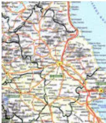
Figure 2: Situation of the city of Larissa in the prefecture.

Larissa is the capital of the prefecture with a population of 126076 inhabitants and it is situated in the centre of the prefecture (Figure 2).