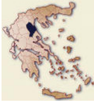
Figure 1: Situation of Larissa prefecture in Greece.

Larissa is the capital of the prefecture with a population of 126076 inhabitants and it is situated in the centre of the prefecture (Figure 2).