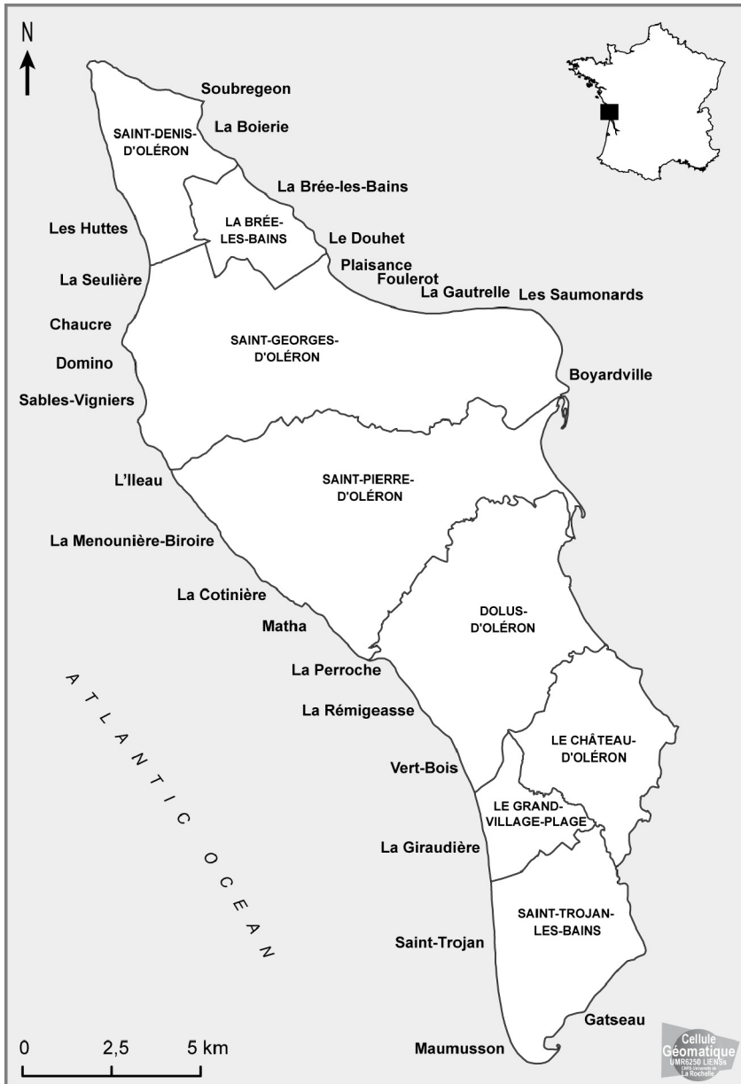
Figure 1: Location of Oléron Island beaches.