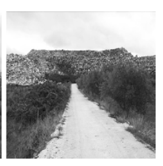
Figure 1: "Escombreiras", mounds of marble wastes.

For all these reasons, the marble is used only in a small amounts in several industries and for building use, road paving material, production of artificial aggregates and soil pH corrections [59]. The remaining part of it still persists on the territory to "deface" the landscape, since the big mounds of wastes cannot be disposed elsewhere due to economic limits. In fact, much costs can be added either in relation to the transport of this residual material to landfills, nearby or far away, or in relation to the work of the individual manufacturing operators.