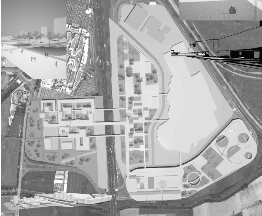
Figure 5: Centro Commerciale Campania, third scenario (students: Carullo P., De Simone S.).

On the southern side of the area flows a small river. Landscaping starts from there and is embedded in the urban fabric. Stormwater is collected on the roofs of any building, some collected in tanks, other parts flow in open swales along the pathways feeding shrubs and grass. Then the flows convey into ponds in parks with depurative and infiltration effects (Jorgensen [14]). The general rule is to divide stormwater collection and management of the sewage is reserved only for black water.