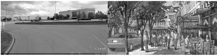
Figure 1: A view of Jamestown Mall before and after its redevelopment.

The CNU research finds 12 cases of redevelopment and chooses to study six of them from which to learn a lesson of success. There are some factors coming from the changing shopping style of consumers that increasingly shows a preference for open air shopping and mix-use developments. This favors a shift to a city center model giving an opportunity to the CNU urban ideal of a sustainable high density model.