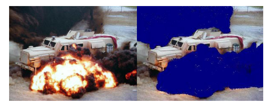
Figure 2: Truck explosion. Left frame refers to a truck explosion showing the real image. The action and smoke propagation is very fast. In the right frame a blue mask shows the algorithm detection. The detection speed is about one second.