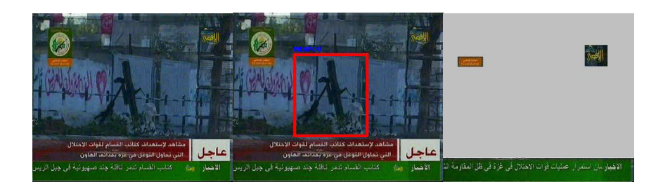
Figure 4: Weapon and text detection.

Video analysis Al-Aqsa TV, January 6, 2009. Also this video is taken outdoors and shows different components: weapon, smoke, text. Applying