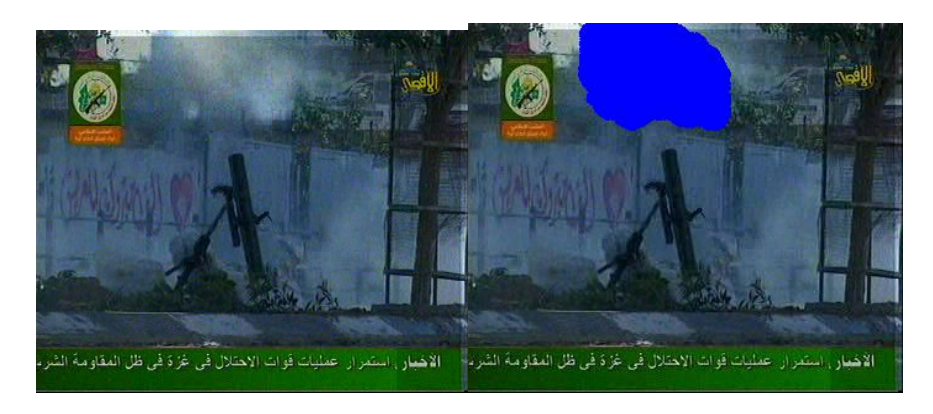
Figure 3: Smoke detection.