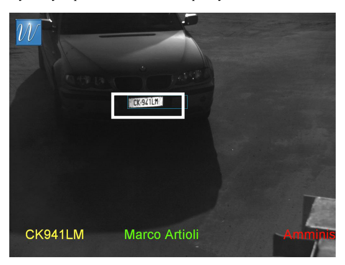
Figure 1: APR example.

On the other side the extraction of data within image/video is dependent to image environment and no often easy to extract. I.e. the plate of a car can be affected by light reflections, dust and so on. In this case text retrieval applicability really depend on video source quality.