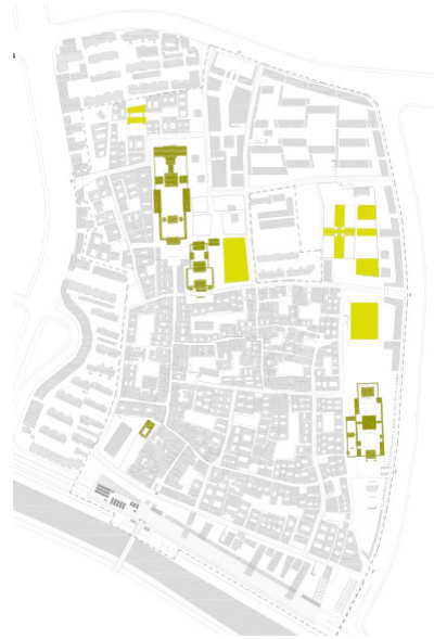
Figure 7: Projection of marks.