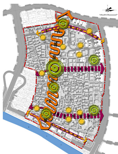
Figure 5: Spatial structure planning.