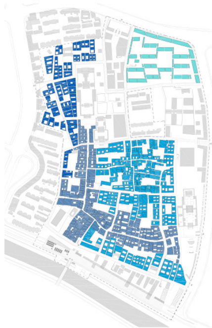
Figure 8: Restoration of dwellings.