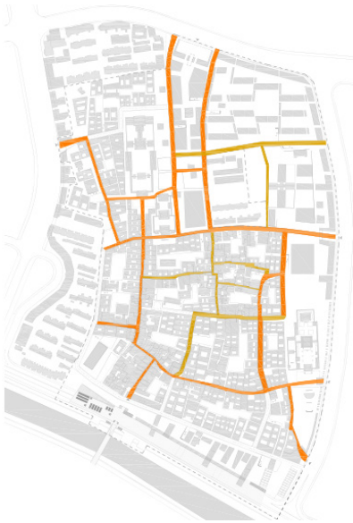
Figure 6: Street repairs.