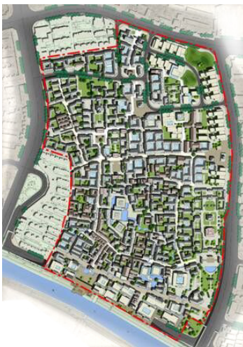
Figure 4: General planning.

Two bands: the southern along the Qingyi River “Riverside tourism leisure belt” and the northern ring north of the city “city life belt”.