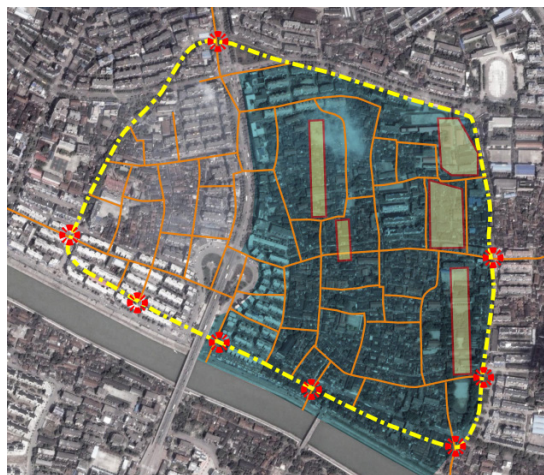
Figure 3: Historic and present superposed map of Wuhu.