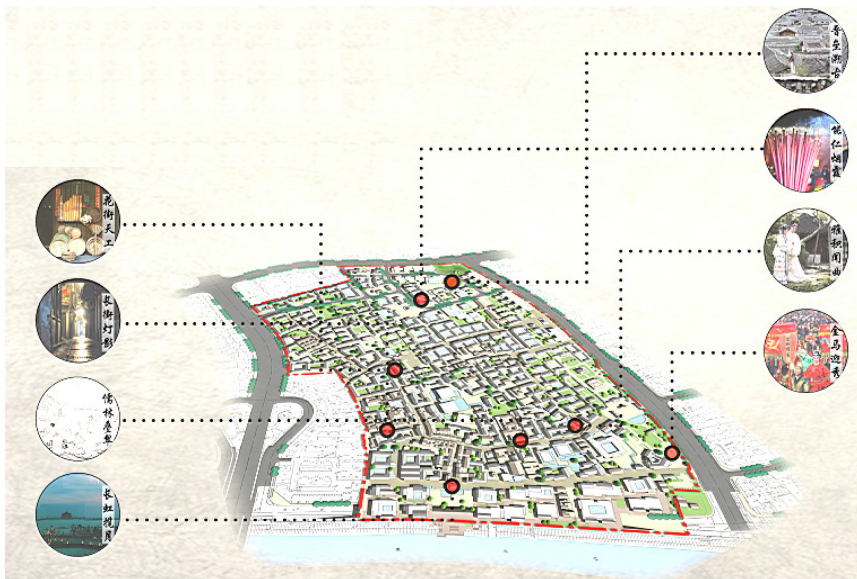
Figure 9: The reshaping of the ancient city of eight sights.

On the basis of excavating and refining the cultural resources of the ancient city, the concept of “Culture River City” is used to reshape the eight sights of the Ancient City in the whole, thus highlighting the characteristics of urban history, culture and urban tourism (see Fig. 9).