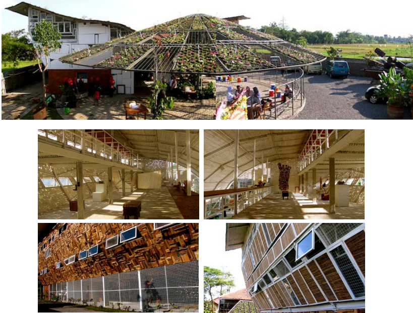
Figure 5: ‘Rempah Rumah Karya’ documentation [7].