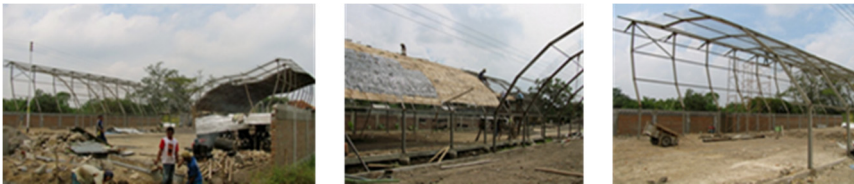
Figure 4: Starting construction of 'Rempah Rumah Karya' [7].

Evolution, started from carrying out real development of ideas and design concepts decisions to achieve the resulted design form of space and building. Real construction starts from the establishment of the test result of steel rods as the main frame or structure to become the contours of the space-building. Following the formation of the main frame is the implementation of enclosures made up of waste materials that have been previously experimented, marking the beginning of the construction process of 'Rempah Rumah Karya' space-building (Figure 4):