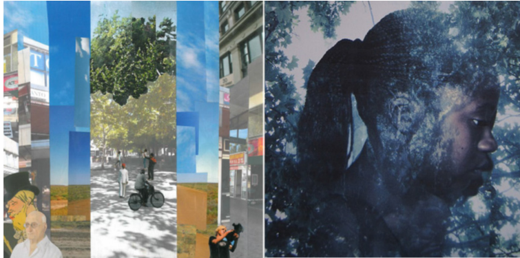
Figure 2: Examples of student visualising experience of Garema Place (Bess Laaring and Sika Manteaw).