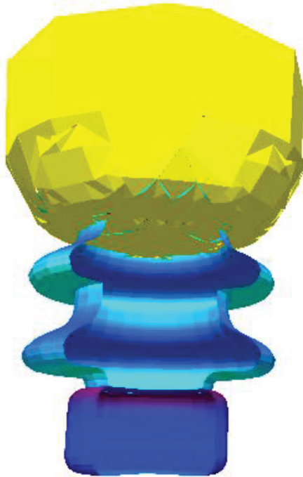
Figure 2: Isosurface of the electric potential of a high voltage insulator.

updated in a next engineering step by an additional description of the temperature. This leads to a bi-directionally coupling between the dependent variables and enables the regard of electric losses within the materials and their temperature dependent behaviour within the simulation.