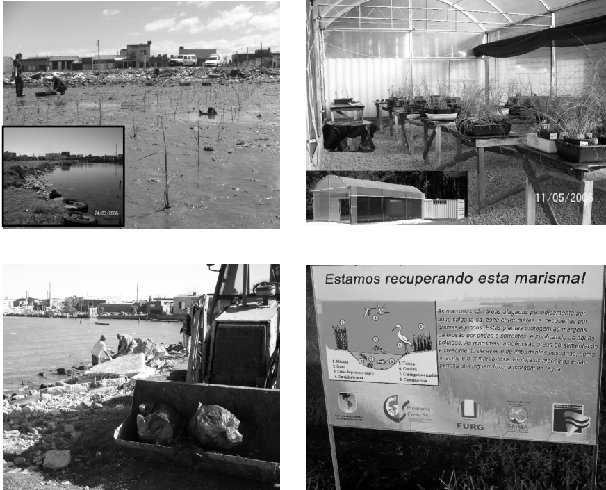
Figure 2: a) Salt marsh restoration in the margins of the urban area of Patos Lagoon estuary, using Spartina alterniflora . The inserted figure shows the same estuarine embayment before the plantation of Spartina ; b) The “Spartinário” installed at the university to produce the plants from seeds; the insert shows the external area of the greenhouse; c) The removal of debris to prepare the terrain; d) The educative panel installed nearby a restoration site.

of the created/restored salt marshes, distribution of advertising material and actions of environmental education. In the first year of the project a marsh area of 10,000 m 2 was recuperated by planting cordgrass Spartina alterniflora propagules, spaced 1 m apart, along slightly erosive margins and across urban runoff drains (figure 2).