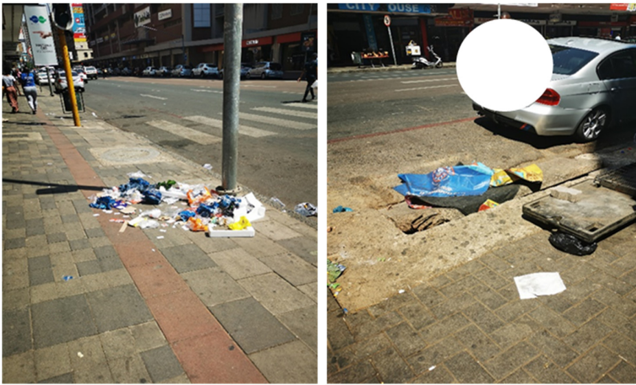
Figure 4: Cleanliness of pavements.