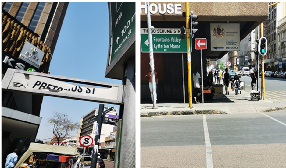
Figure 5: Signage.

around the CBD. The traffic lights around the CBD of Tshwane did not have countdown signals and a few had push buttons that were not functional.