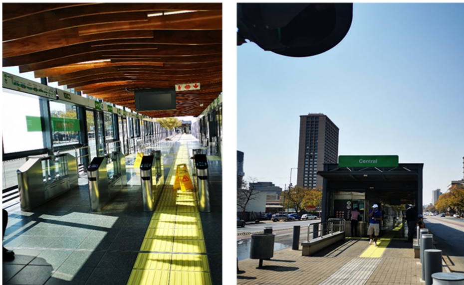
Figure 7: A Re Yeng bus station.