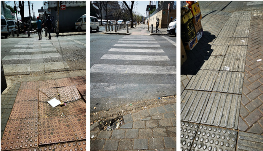
Figure 3: Tactile surface.