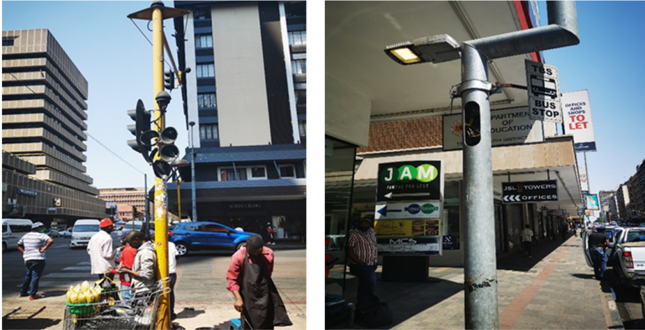
Figure 6: Traffic light and street light.

maintenance. Some of street furniture such as lights and bins were poorly spaced and positioned. It was also observed that some street lights are left on during the day. Some bin containers were full of rubbish and the containers looked dirty. Around the CBD of Tshwane, only a few seating areas were observed.