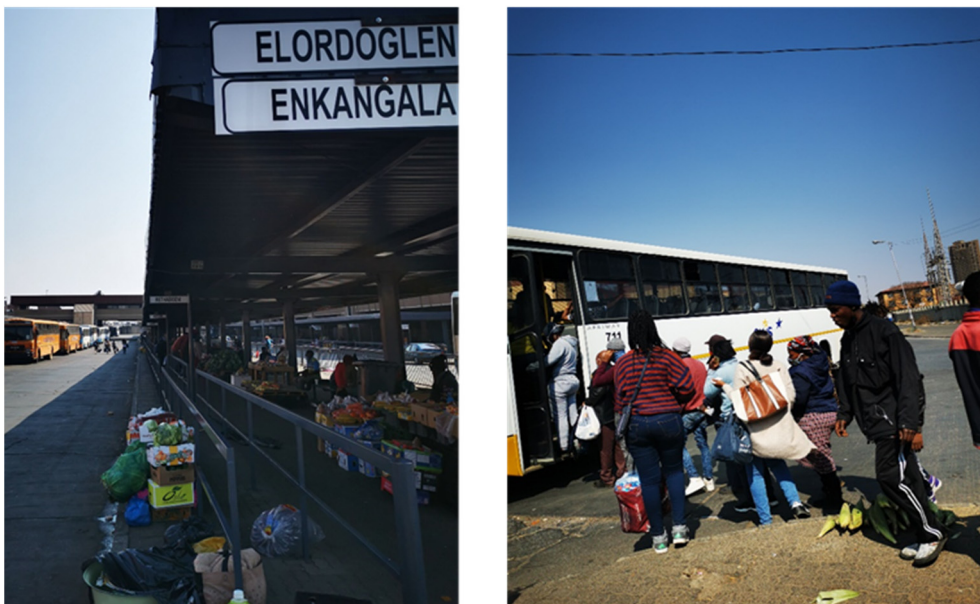
Figure 8: Marabastad bus station.

did not have ramps and some buses were loading in the middle of a road. Luggage was obstructing the free flow of passengers. There were no ticket counters at Marabastad bus station that were identified.