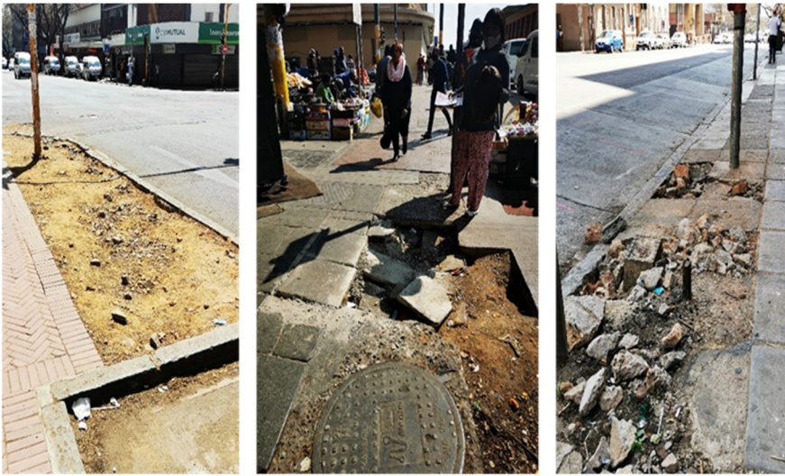
Figure 2: Maintenance of pavements.