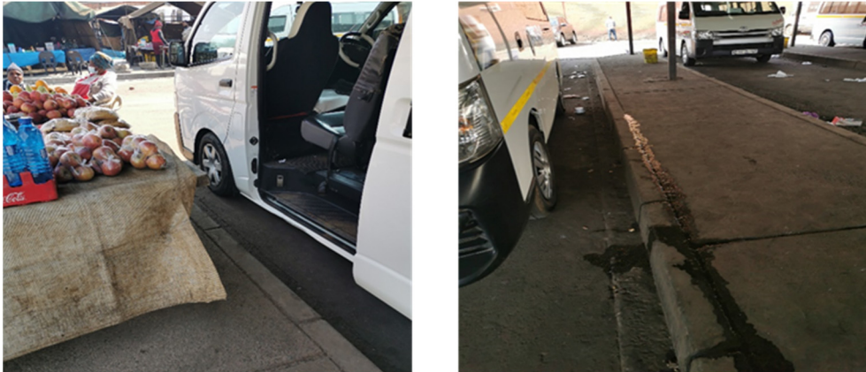
Figure 9: Taxi loading zone.

The two types of taxi ranks for mini-buses around Tshwane CBD are off-street and on-street taxi ranks. It was observed that some of the off-street taxi ranks did not have pavements and other amenities such as toilets and shopping facilities. Off-street taxi ranks had uneven gravel surfaces which was not ideal for people using wheelchairs. One of the basement off-street taxi ranks did not have good lighting and ventilation. Fig. 9 shows a taxi loading zone.