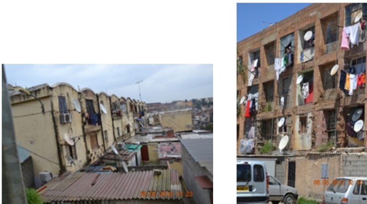
Figure 6: Precarious housing in Oued Ouchaieh (building on the right has been demolished in January 2015).

The re-housing of inhabitants of deteriorated properties and slums respond to the logic of land recovery which leads to eviction, may be important for the realization of the central level projects already decided, but with social consequences.