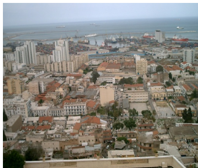
Figure 2: View of the port of Algiers.

The Strategic Plan is not a plan of issues, objectives and actions; as is intended by the urban project approaches, but looks like a real POS (Land Use Plan). This translates, operationally, into the political vision of the ideal image to give to Algiers. This image reminds us of some international projects, including the Barcelona model or the Marseilles City Projects [3].