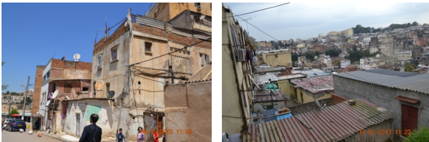
Figure 7: Auto-construction housing in Oued Ouchaieh.

Renovation (planned and demolitions already started) of the popular area of Oued Ouchaieh, whose urban component consists essentially of the resettlements (Bou-Maaza, the neighborhood of palm and several slums and auto-constructed housing), with a very poor and precarious architectural and urban typology, reflects the policy of eviction.