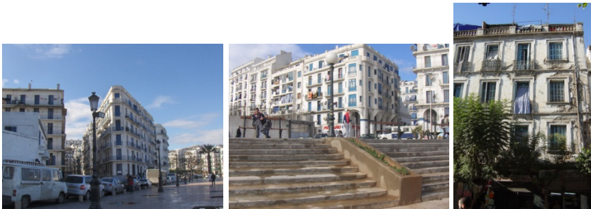
Figure 4: Different views of the old buildings of Bech-El-Oued.

For the Strategic Plan, rehabilitation essentially means: the rehabilitation of underground networks, the development of public spaces, the reinforcement of buildings and the rehabilitation of facades. The operation of the “1st November” Avenue has focused on the apparent aspects of the avenue: elimination of satellite dishes, air conditioners, burying telephone cables and new flooring installation. These are certainly necessary, but completely superficial operations with regard to what should be an urban rehabilitation.