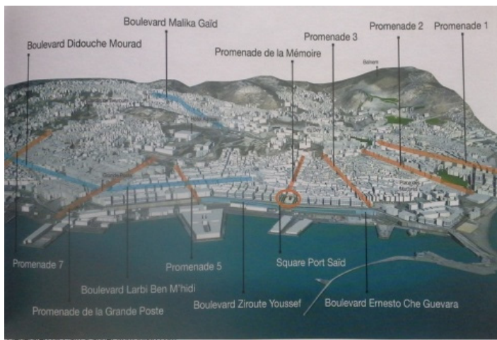
Figure 5: The different proposed promenades (promenades 1 and 2 in Beb-El-Oued) [1].

Analysis of Beb-El-Oued, located west of Algiers, which covers a coastal strip of 2 km and has a population of 64,732 inhabitants, shows that the projects under the Strategic Plan (promenades 1 and 2) for the neighborhood are not adequate to assert directly or indirectly on the improvement of some of the central areas of Algiers (Figure 5).