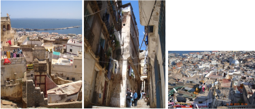
Figure 3: Different views on the old Casbah of Algiers.

We focused primarily on the white plan, with the objective of urban restructuring, renewal of neighborhoods and rehabilitation of the medina of Algiers, declared World Heritage by UNESCO thirty years ago. Our approach is to check the priorities assigned by the two plans (PDAU and Strategic Plan).