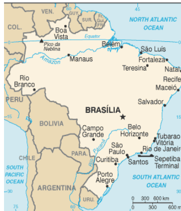
Figure 1: Port of Santos localization.

The Port of Santos, the biggest in Brazil, a gateway to the most heavily industrialized southwest and central-west regions is located in the Brazilian central coast (25° 53' South 46° 19' West) 90 km from São Paulo city, the economic capital of the country (Fig.1).