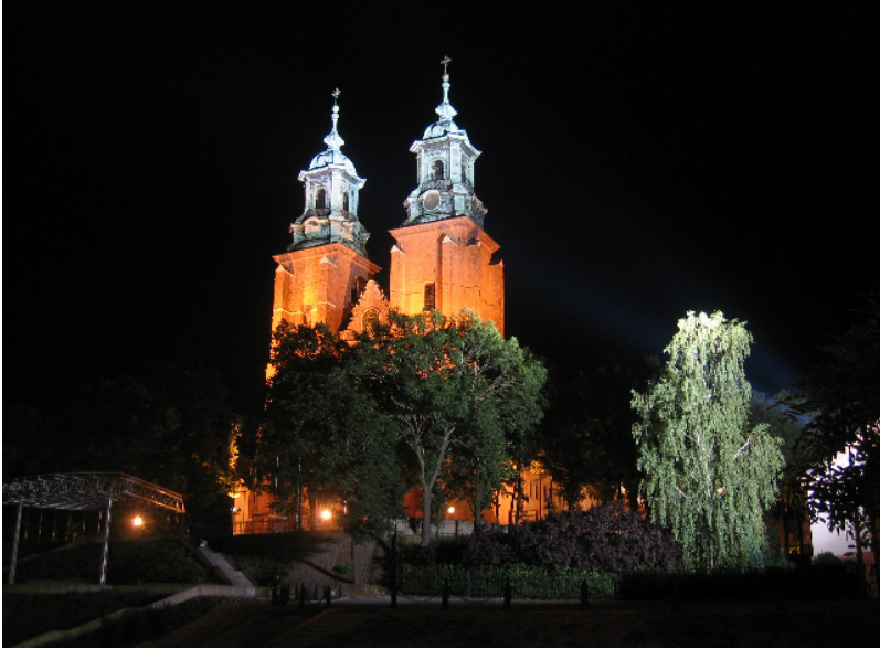
Figure 2: Illumination of Cathedral in Gniezno.

The external illumination project has been accompanied by a change in the internal lighting. The existing candelabrum with incandescent lamps have been replaced with fittings with discharge light sources (white soda and metal-halide) – fig. 3.