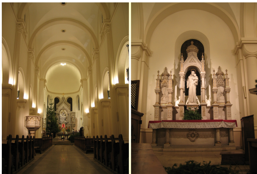
Figure 1: Interior of the church of Virgin Mary Sorrowful.

An example of such realization is the lighting system applied in the church of Virgin Mary Sorrowful in Poznań – fig. 1.