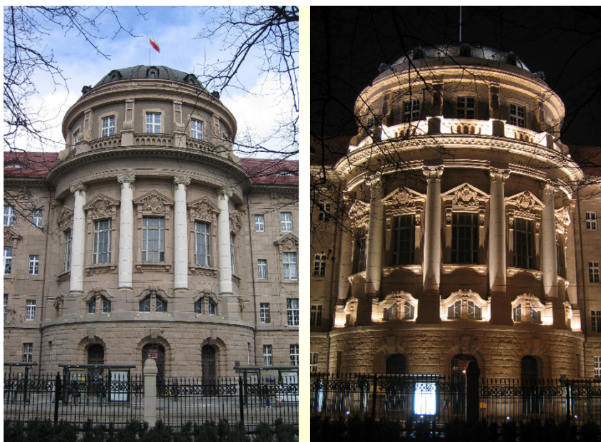
Figure 4: Illumination of the front side of Collegium Maius.

An example of such realization is the illumination of the Collegium Maius in Poznań – fig. 4.