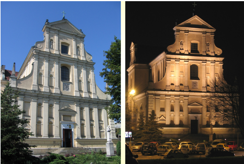
Figure 6: Front elevation of St. Joseph church – daily and nocturnal view.