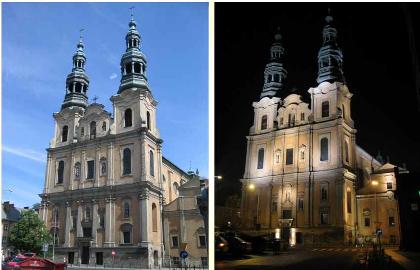
Figure 7: Front elevation of St. Francisco church – daily and nocturnal view.

For the illumination lighting of the church front and towers, there have been applied the luminaires equipped with the metal halogen light sources of power from 35 up to 150W, assembled on the existing street lighting pillars. The obtained illumination result has been presented on fig. 7.