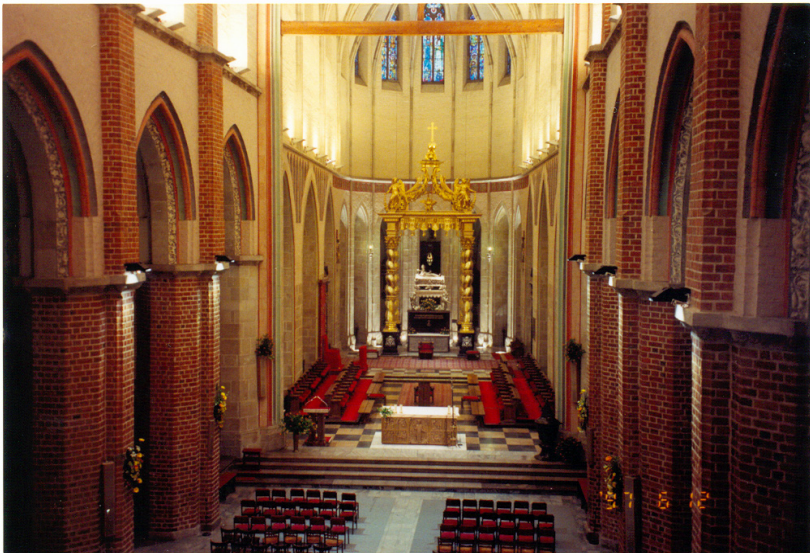
Figure 3: Interior of the Cathedral.

The external illumination project has been accompanied by a change in the internal lighting. The existing candelabrum with incandescent lamps have been replaced with fittings with discharge light sources (white soda and metal-halide) – fig. 3.