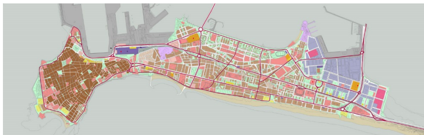
Figure 1: Plan of the city of Cádiz. General Urban Development Plan of 2012.

In Spain, the General Urban Development Plan (GUPD) is the main legal instrument for town planning. Its first appearance dates back to the 1923 Municipal Statute, although it would not be mandatory for all towns until the approval of 1956 Spanish Land Act. The GUPD is responsible for controlling the setting-up, functioning and discipline of activities for every town use: residential and economic activity, social centres, infrastructures and open or natural areas.